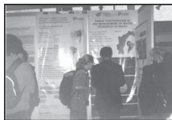
Discussions with authors at the poster session.