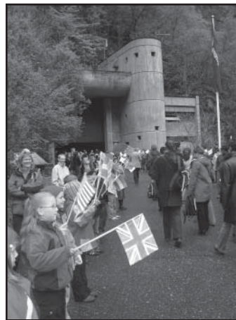
Delegates arrive at Hylen Power Station for the boat trip dinner, greeted by school-children waving flags they had created for every country represented at the conference.