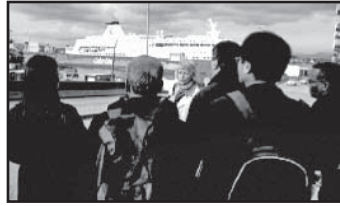
Urban transformation in Stavanger technical visit: delegates view activities in the harbour and industry area.